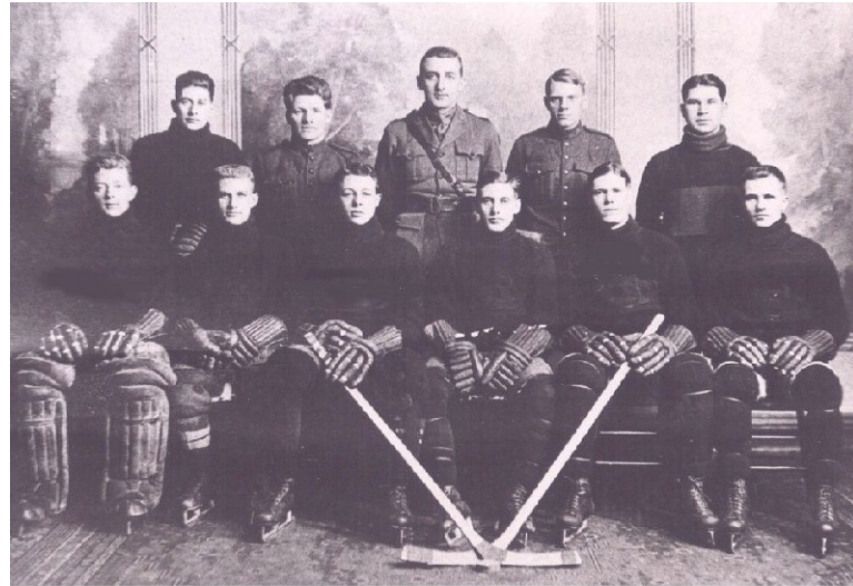
223rd O.S. Battalion (Canadian Scandinavian) Hockey Club Winnipeg Patriotic League, Season 1916-1917

Monday Feb. 12th: Went downtown in afternoon. Dropped into Stag. Everybody shows 5-3 or 2-1 on us for game. Hockey game in evening. Just managed to beat Vics 8-7. They tied us 6-6 at half time.