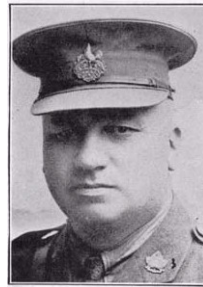
Skaptason - they may have lived at Hythe near Shorncliffe